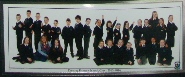
Dunclug Primary School, Choir 2015-2016